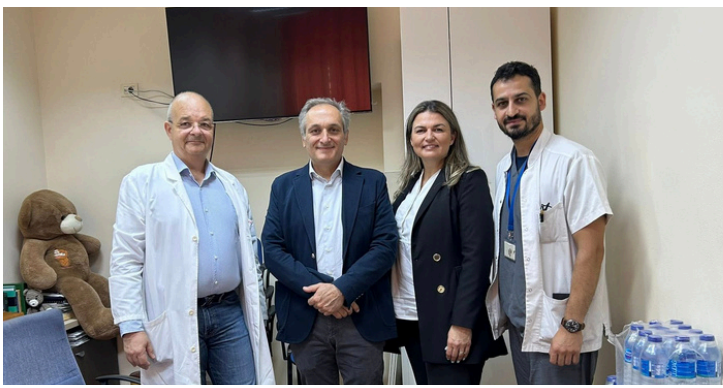
International medical partnership – Rizzoli Orthopaedic Institute (Bologna) & "Grigore Alexandrescu" Children's Emergency Hospital

We strengthened our partnership with the Rizzoli Orthopaedic Institute in Bologna to support the treatment of children with sarcomas by providing access to expertise in pediatric oncologic surgery.