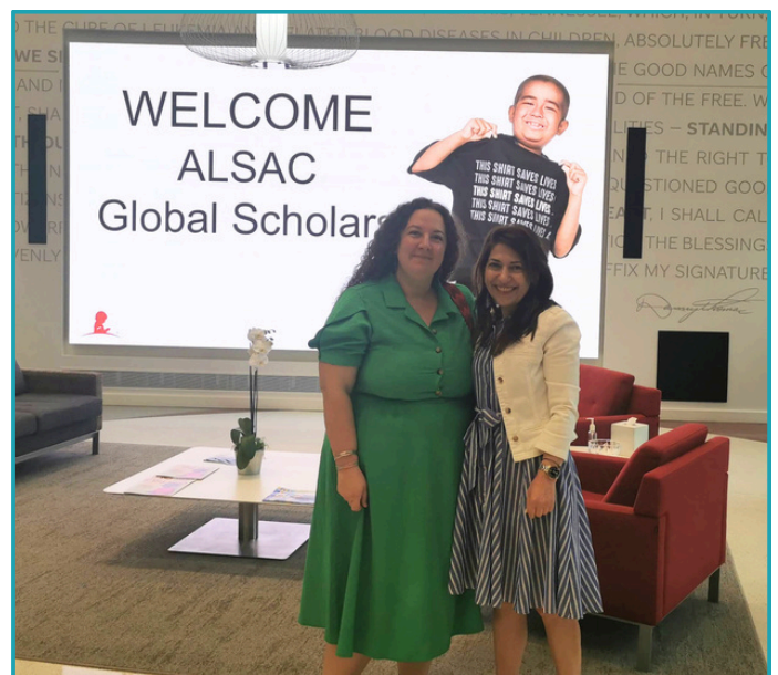
Participation in the ALSAC Global Scholars Fundraising Program – 2025