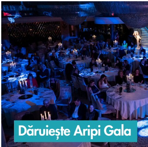
Dăruiește Aripă Gala

88,000 euro donations for children with cancer